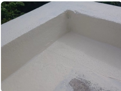
Step 4: Reinforce Neotextile fabric at the base of the wall while the first layer is still wet to increase tear resistance.