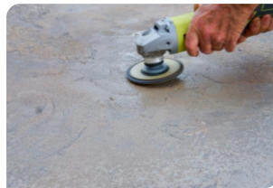
Use a grinder to polish the concrete surface