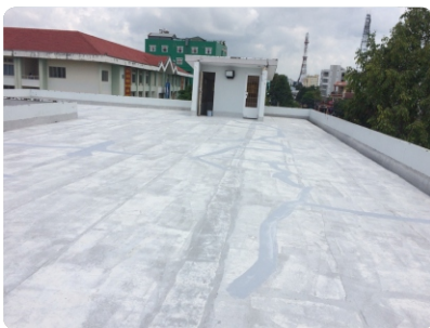
Step 1: Clean concrete surface before construction