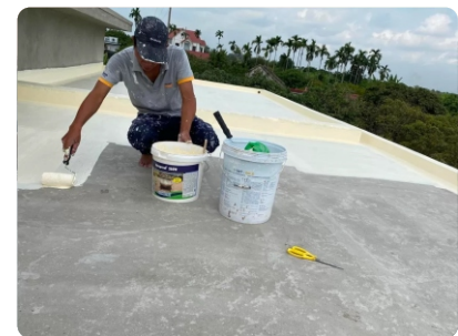
Step 3: Apply the first coat (mixed with 5% water) after 2 hours of finishing the primer. Consumption: 0.5 kg/m 2 (the main material must be stirred with a slow speed mixer for 3 minutes before application, ..)