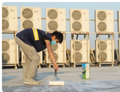
Step 2: Apply Revinex primer mixed with water (ratio 1:4). Consumption: 0.05 kg/m 2 (Primer must be stirred with a slow speed mixer for 3 minutes before application,...)