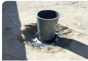
Clean the neck of the pipe, wrap the expansion bar