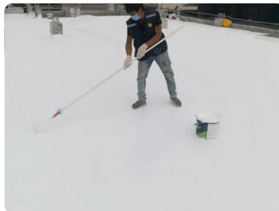
Step 5: Apply the second coat (pure), at least 2 hours after the first coat is completed and before 24 hours. Consumption: 0.5 kg/m 2