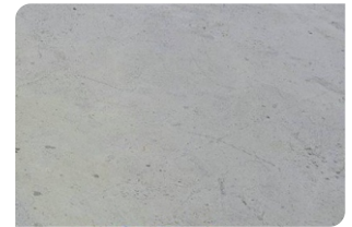
Concrete surface achieved