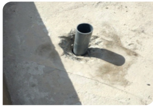
Chisel around the pipe neck, insert foam or formwork below the pipe neck