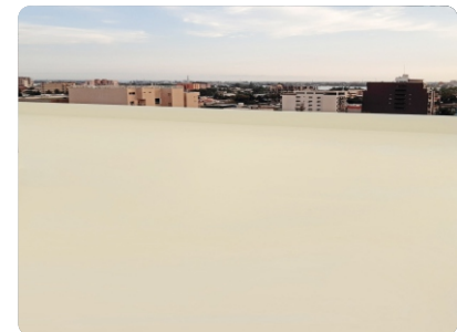
Step 6: Finished surface. (Material fully cured after 7 days)