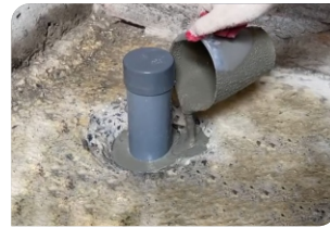
Grouting Construction Lemax Grout LM-G650