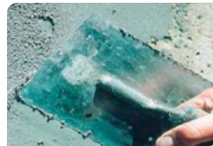
Patching concrete surfaces with Neorep repair mortar