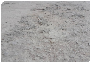
Unfinished concrete surface