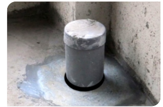
BS 8620S Sealant Injection around Pipe Neck