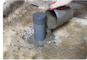
Grouting Construction Lemax Grout LM-G650