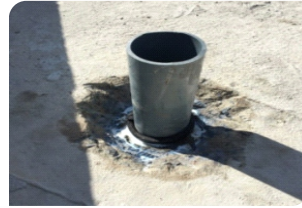
Clean the neck of the pipe, wrap the expansion bar